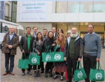
Here's part of the group gathering outside the Medicine Week Congress House