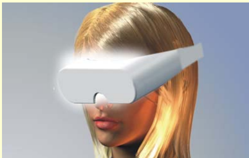
Intensive white radiation 9,000-14,000 lux wavelength 400-700 nm