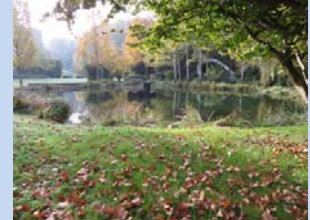
Beautiful Baden-Baden in the Fall!